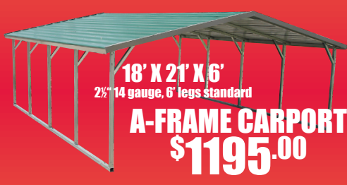
A-FRAME CARPORT $1195.00