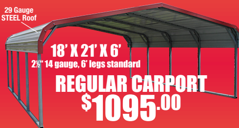
REGULAR CARPORT $1095.00