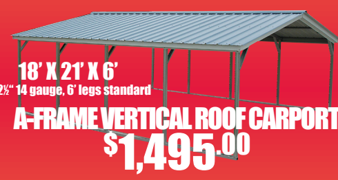
A-FRAME VERTICAL ROOF CARPORT $1,495.00

Prices for regular style, open carport with 6 ft. legs