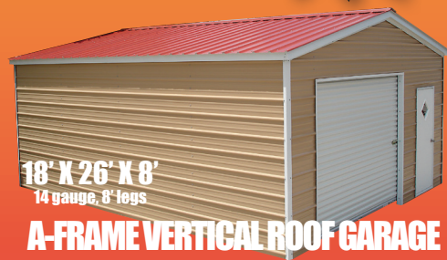
A-FRAME VERTICAL ROOF GARAGE